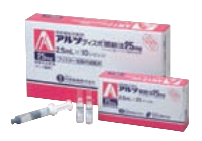
Artz (Sodium hyaluronate)

Fenofibrate is a fibrate compound developed by Fournier Pharma (now Solvay S.A.) in France.