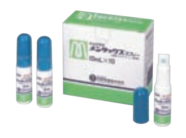
Mentax (anti-trichophyton agent)