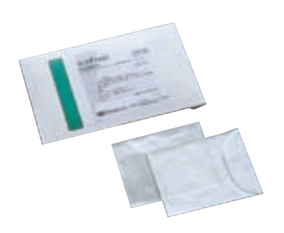
Seprafilm (synthetic-absorbent anti-adhesive barrier)