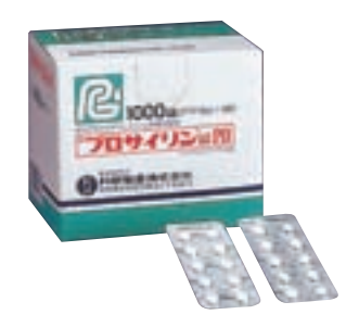
Procylin (oral prostaglandin l2 analog)