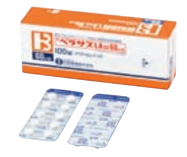
Berasas (Oral Prostaglandin l2 analog Sustained-Release Formulation)