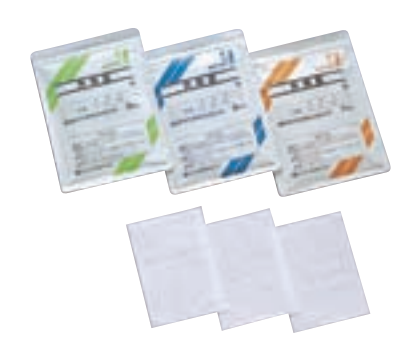
Adofeed (pain- and inflammation-relieving plaster)