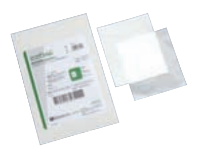
Seprafilm (synthetic-absorbent anti-adhesive barrier)