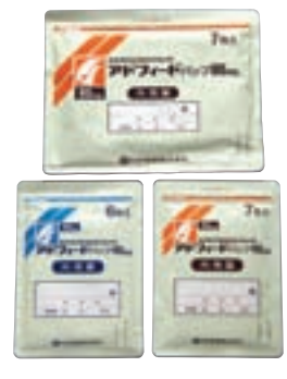
Adofeed (pain- and inflammation-relieving plaster)