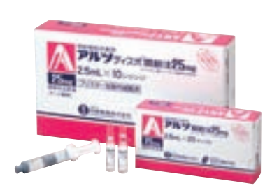
Artz (Sodium hyaluronate)

In 2004, we launched a new spray formulation of Mentax.